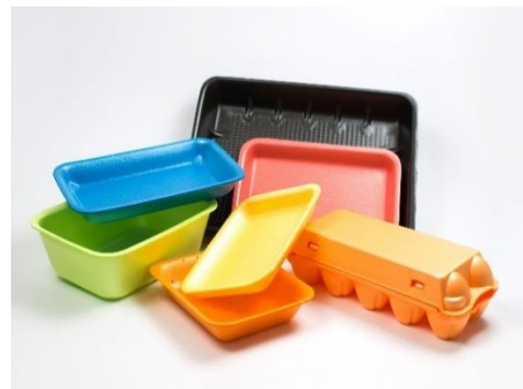
Sample of PS