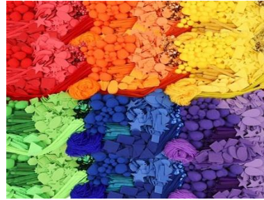
Technique: mixed media Plastic Type: HDPE LDPE, PP Theme: Blue painting

The innovative painting technique used in this work was assemblage. It was felt that HDPE and LDPE plastics could be added of times then cut to create depth. These types of plastics offer a variety of colours that go along with the theme composition