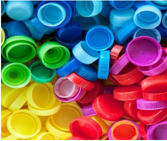
Technique: mixed media Plastic Type: HDPE, LDPE, PETE Theme: In my dream