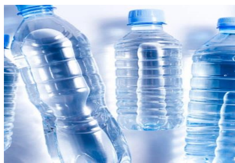
Samples of PETE plastics