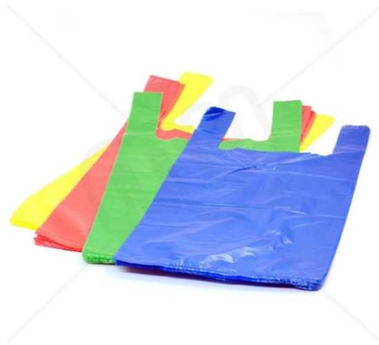
Sample of LDPE